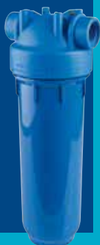
Image: 10" Standard